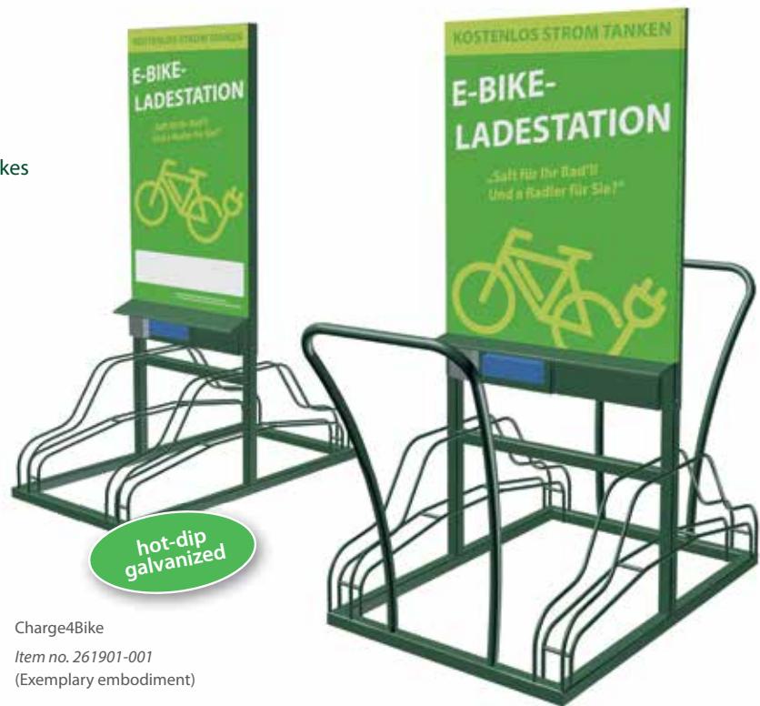
Charge4Bike Item no. 261901-001 (Exemplary embodiment)